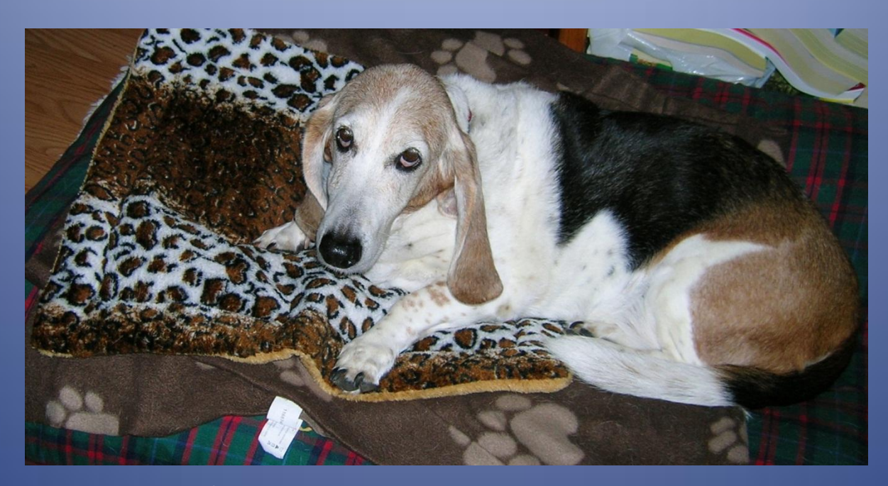
My dog, Denver, is an organism.